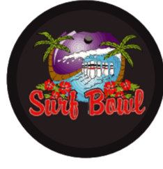
19th Hole Coaster